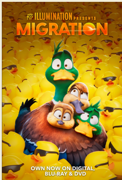
Option 1: Migration