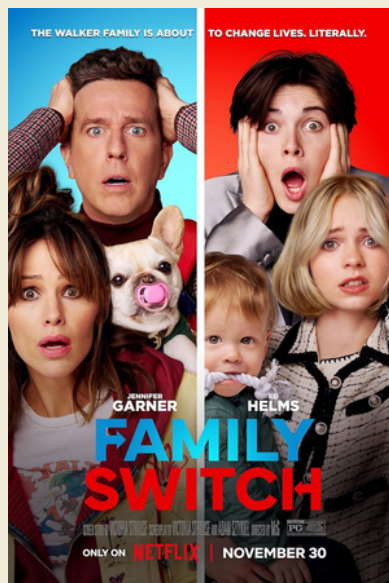
Option 2: Family Switch